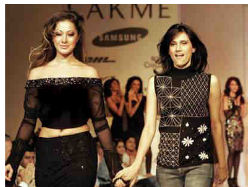
Fashion shows are very popular with the media.

As citizens of a democracy, the media has a very important role to play in our lives because it is through the media that we hear about issues related