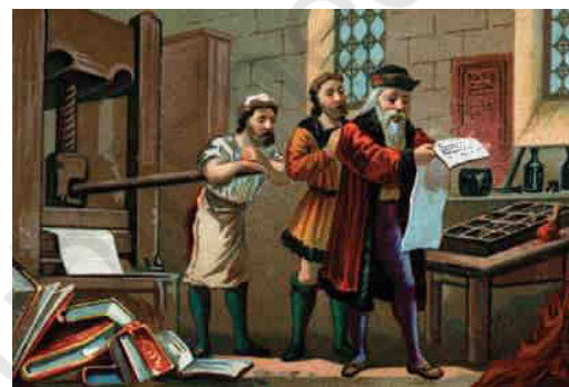
An artist's impression of Gutenberg printing the first sheet of the Bible.

Changing technology, or machines, and making technology more modern, helps media to reach more people. It also improves the quality of sound and the images that you see. But technology does more than this. It also changes the ways in which we think about our lives. For example, today it is quite difficult for us to think of our lives without television. Television has enabled us to think of ourselves as members of a larger global world. Television images travel huge